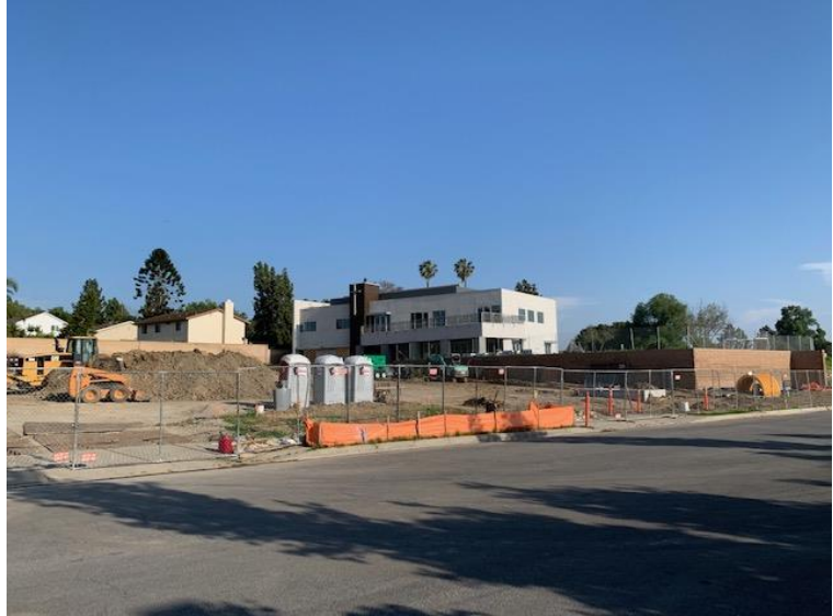
Notice the framework going in the parking lot.....