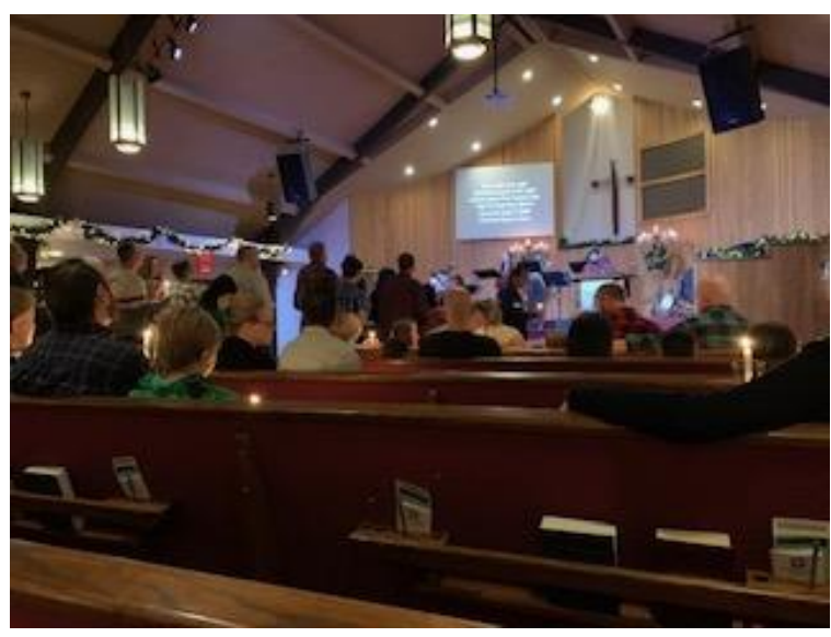
Candle light Service Christmas Eve at Redeemer