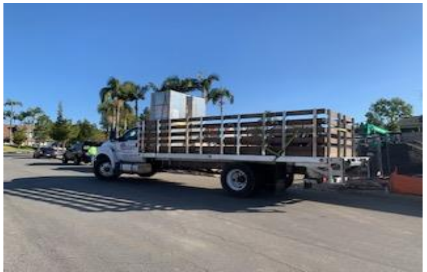
Delivery for work going on "INSIDE" Rain doesn't stop everything!