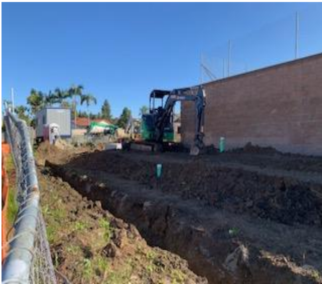
Digging trenches for power lines.