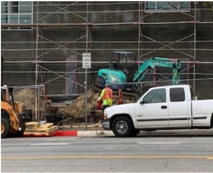
More work on the fire hydrant.....