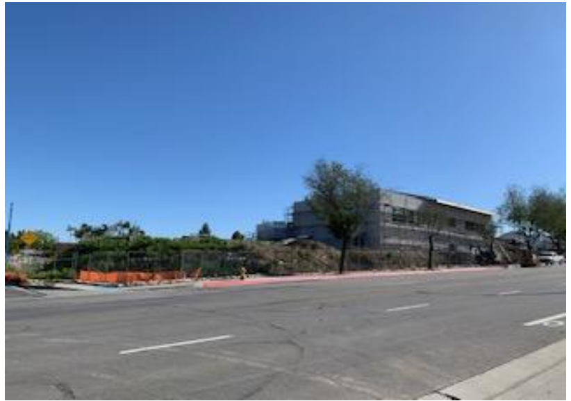
Lots of work "inside" due to the weather....