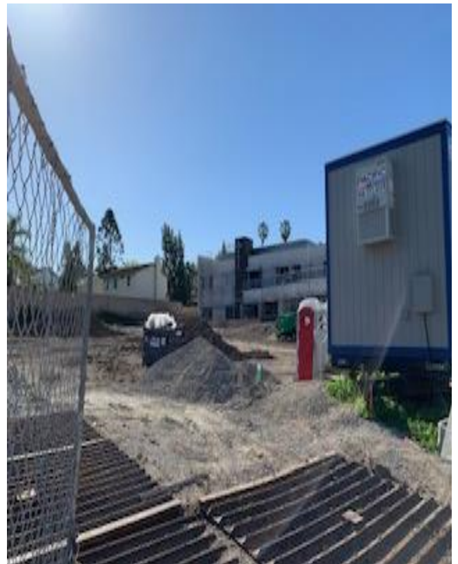
Rain delays on parking lot.